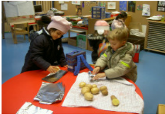
Preparation in school.