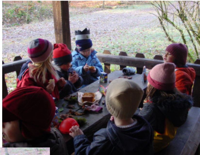
In the forest we eat it and celebrate the anniversary.