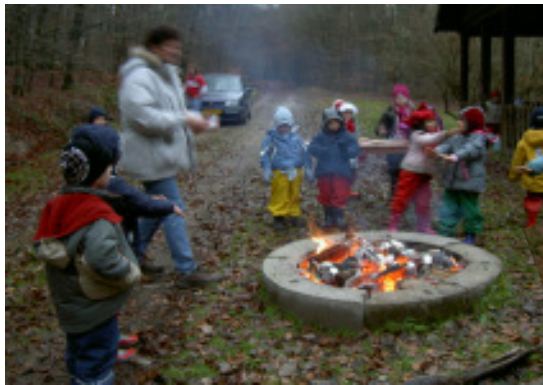
The potatoes in the fire!