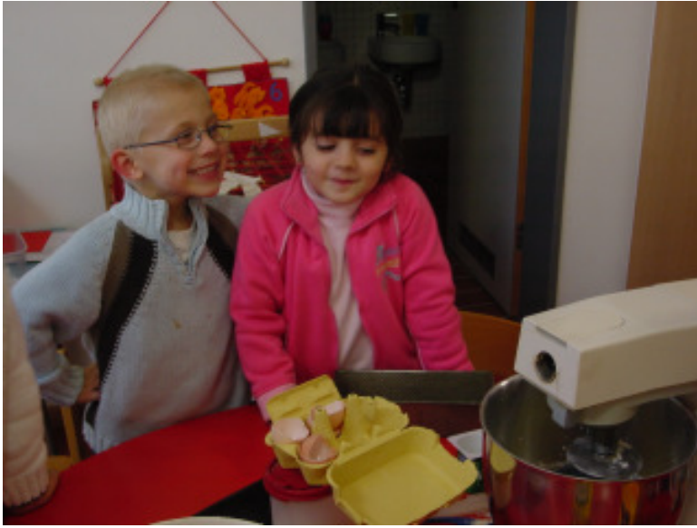
The children prepare their cake with the teacher .